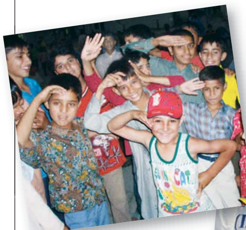
Children orphaned by the 2005 earthquake readily responded to the Islamabad Chapter's outreach, which included a program, gifts, and hugs for all.

The Sri Lanka chapter , in conjunction with the EWC's Schools-helping-Schools Program (AsiaPacificEd), presented over $7,000 (U.S.) to five tsunami-affected schools.