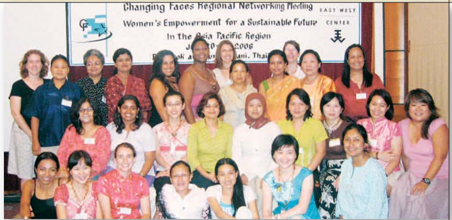
"Changing Faces Women's Leadership Program" alumnae from 15 countries gathered in Thailand for a reunion and study tour.