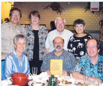
Members of the new Arizona (Grand Canyon) chapter convene their inaugural meeting.

Four new alumni chapters were officially established in Islamabad and Hyderabad, Pakistan; Shanghai; and Arizona, bringing the number of chapters in the EWCA network to 47.