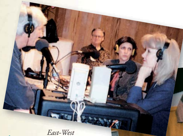
East-West Center staff and students support Hawai'i Public Radio's on-air telethon as a community outreach activity.

The Office of External Affairs connects the resources and research of the East-West Center with the local, national, and international community through news media and public information services; briefings for visiting officials; and public affairs, community relations, and public programs. This office also comprises the Arts Program, the EWC Alumni Office, and EWC program representatives in the Asia Pacific region.